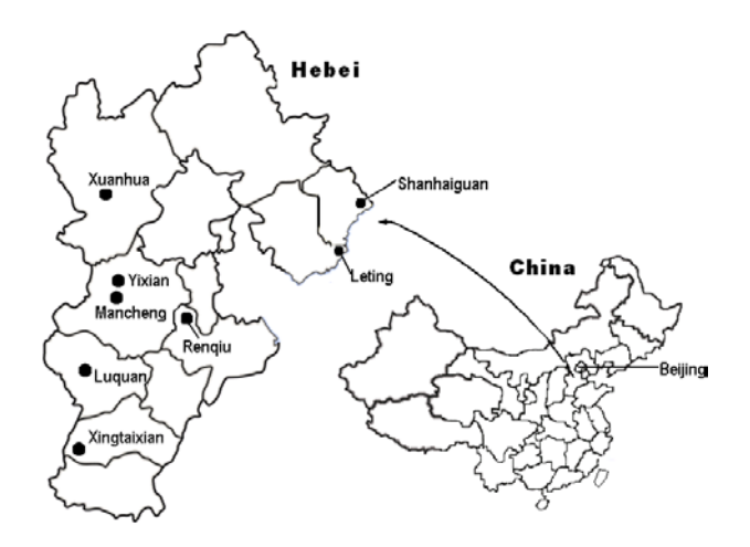
FIGURE 1 MAP OF CHINA AND HEBEI PROVINCE WITH THE LOCATIONS OF THE EIGHT COUNTIES MARKED

where P represents the household's probability of transferring (taking on a value of 1 if the farmer is willing to transfer and 0 if not willing). The independent variables (Xi, I =1, ..., 6) were chosen to represent factors that were hypothesized to affect the decision whether or not the household was willing to transfer their land use rights. The coefficients of the logistic model were estimated with E-views software. The variables were used and their hypothesized effects have been described below.