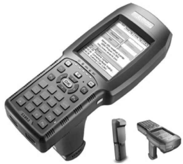
FIGURE 21.2. Portable UHF Reader.

The first problem is to protect wireless communication between mobile RFID readers and the centralized database system, and this can be addressed by using popular cryptographic protocols (Trappe et al. , 2007), such as AES, PKI or PGP. An easier way is to use a publickey infrastructure (PKI) method to encrypt data from mobile units and transmit cipher texts to the back-end database system. The PKI method is a relatively strong encryption method that prevents hackers from spoofing data, manipulating information, and man-in-the-middle attacks by replaying previously spoofed data through the network. We can also use the Diffie-Hellman key exchange method to establish trust between mobile units and the back-end database to reduce possibilities of man-in-the-middle attacks. In our opinion, the RFID tags do not reveal much valuable or critical food safety information, but nevertheless it is necessary to safeguard it.