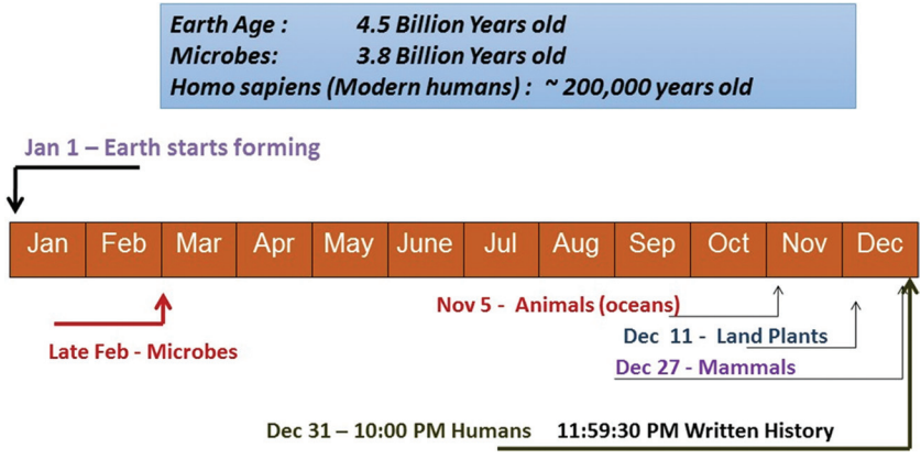
FIGURE 1.1. Schematic Representation of Earth's Age as a 12-Month Calendar.

ological adaptions include the circularization of the bacterial cells during stress conditions, the accumulation of nutrient storage molecules during periods of starvation and the switching on of stress response genes when exposed to stress conditions. Today, we know that microbes outnumber humans on this planet by unimaginable numbers. The human population is approximately 7.4 billion (or, in other words, 7.4 \times 10^9 humans). There are more microorganisms than this number in just one gram of human feces! Even on a single human body, microbes are thought to outnumber human cells by a factor of 10. Thus, it is not surprising that microbes continually influence human and animal health. Many of these microbial populations are opportunistic pathogens and under the right circumstances proliferate and cause disease (ILSI, 1996). There are a number of excellent books and review articles that detail the nuances between opportunistic pathogens, commensals, and frank pathogens (Abt and Artis, 2013; Behar and Louzoun, 2015; Packey and Sartor, 2009).